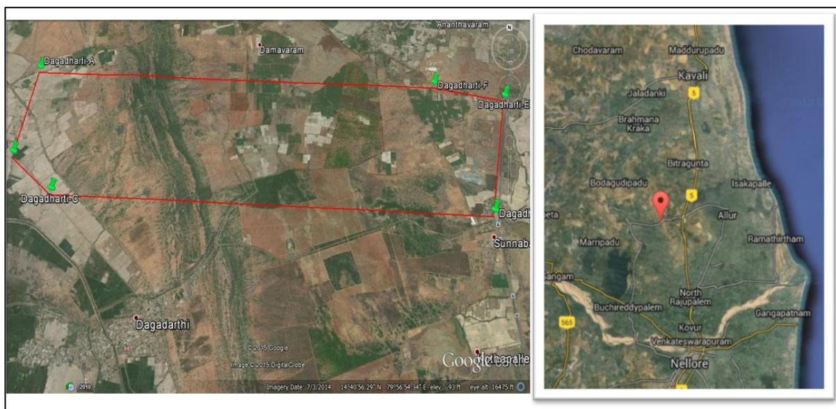
Figure: Location of Dagadarthi Airport Site

The proposed site at Dagadarthi is well connected to other parts of state by well-developed network of National and State Highways.